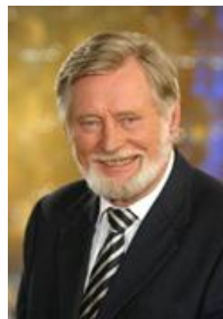
Dr. JÜRGEN HOGEFORSTER CHAIRMAN OF THE HANSEATIC PARLIAMENT

Our thinking today determines our future tomorrow. That is why the eighth Hanseatic Conference will mobilize the top level of thinking, stimulate new thinking, communicate many positive examples from medium-sized enterprises and create building blocks for the common formation of a good future.